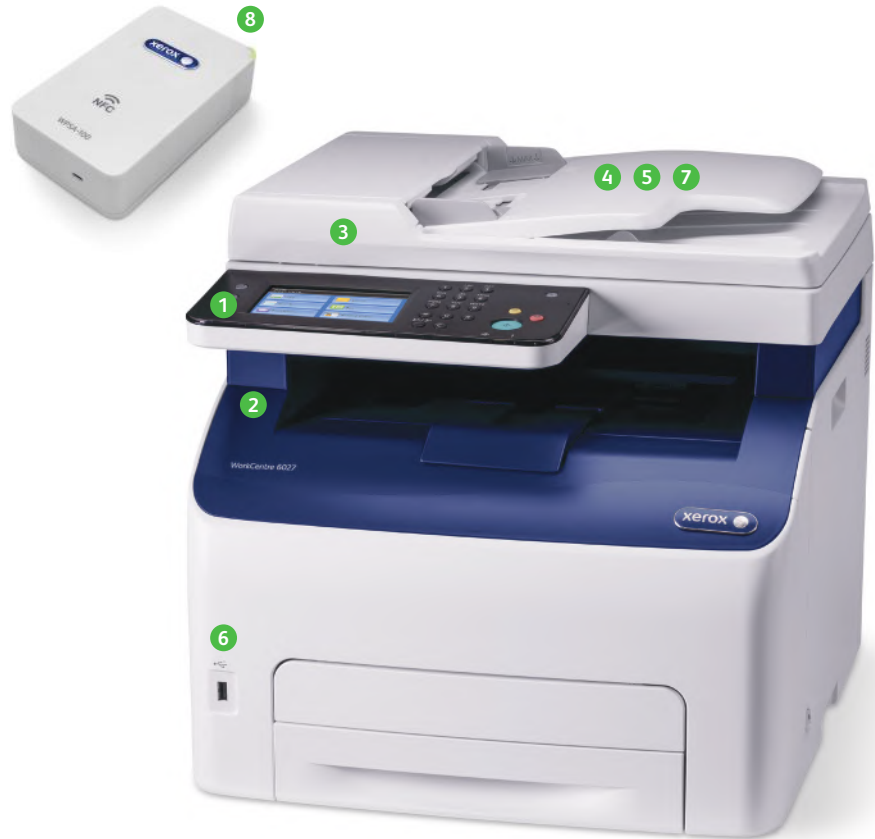
WorkCentre 6027. Copy. Print. Scan. Fax. Email.