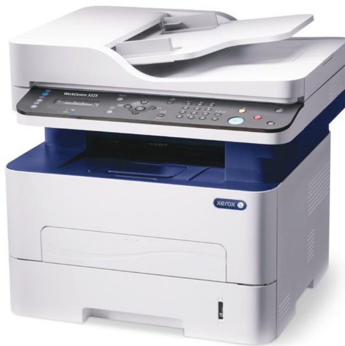
WorkCentre 3215/3225. Copy. Print. Scan. Fax. Email.