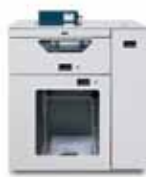
C.P. Bourg BSFx Dual-Mode Sheet Feeder