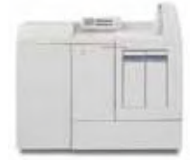
Xerox® DB120-D Document Binder