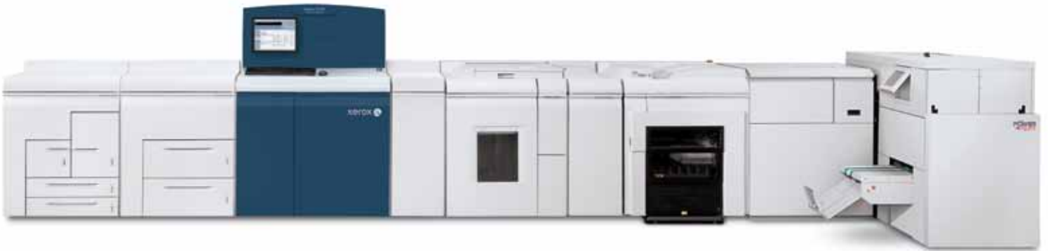
Xerox Nuvera® 157 EA Production System with Xerox® Production Stacker and Watkiss PowerSquare 200